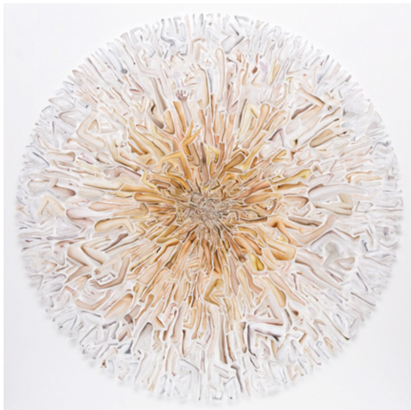
Gravitational Radius , 2012. Digital images, laser-cut digital print, pins, foam panel, 47" x 47" x 3 1/2"

In “Hither and Yon” Adey utilizes a diverse range of materials and techniques to investigate the concept of constraints as a metaphor for the human condition. Each artwork within this exhibition has undergone a methodical process for its creation within the bounds of a self-realized constraint. With this approach Adey is able to find not only artistic freedom, but also a common thread that unites these seemingly tangential mediums.