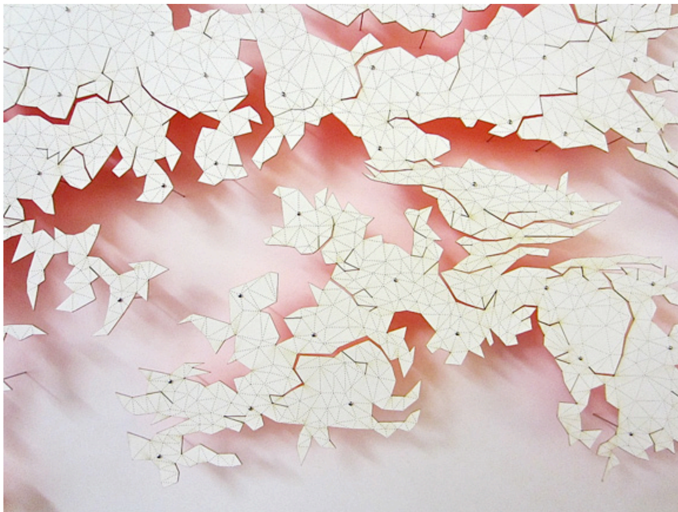
Hide (DETAIL), 2013, laser-cut digital print, pins, foam panel

In Hide , an inventive take on a self-portrait, Adey explores a different method of deconstructing and flattening the human form. Beginning with a three-dimensional scan of his entire body, he creates a triangulated three-dimensional model of himself comprised of over 75,000 triangles. From there, the model is unfolded and flattened to form a two-dimensional record of the entire surface of the artist's body, all in one piece, without overlaps. This two-dimensional apparition is then laser cut and framed in two adjacent panels to create a diptych resembling a cross between a Dymaxion Map and a Rorschach test.