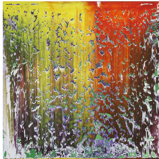
IR-30-1, 2012, Acrylic on canvas, 49” x 49”

Casselmann attempts to reconcile his own truth with the truths of time, space and consciousness by creating works of pure abstraction. His process involves applying several layers of acrylic paint to a wet canvas using a flexible squeegee. The squeegee tool allows the artist to gently add, subtract or scrape away paint on the entire surface of a given work in one motion, resulting in paintings that are intensely complex, yet harmonious and consistent in form.