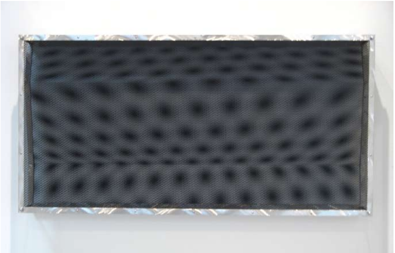
Tango Dots, 2009. Stainless and powder coated steel, aluminum, 24 x 48 x 6 inches.