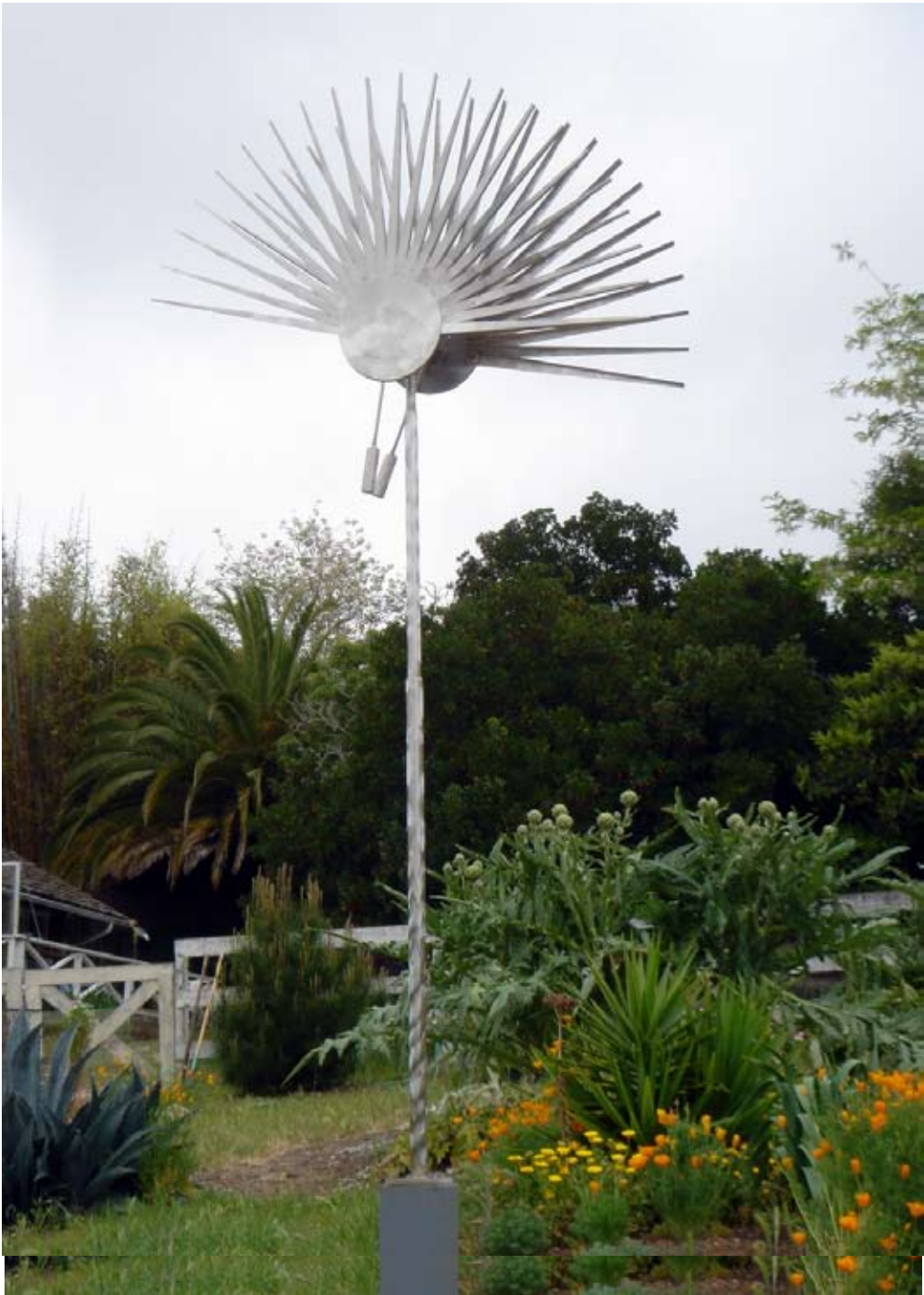
Estacas, 2009. Stainless steel, 110 inches tall x 54 inches across. Edition 1/3.