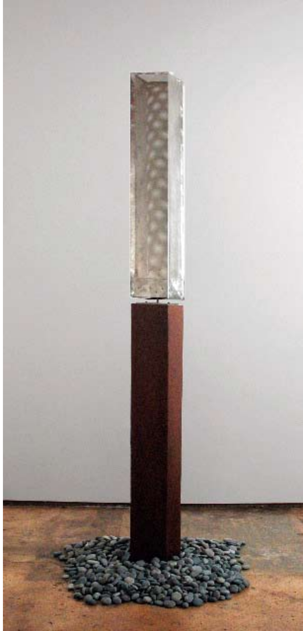
Rhomboid Column, 2003/2008. Stainless & mild steel, 88 x 10 x 6 inches.