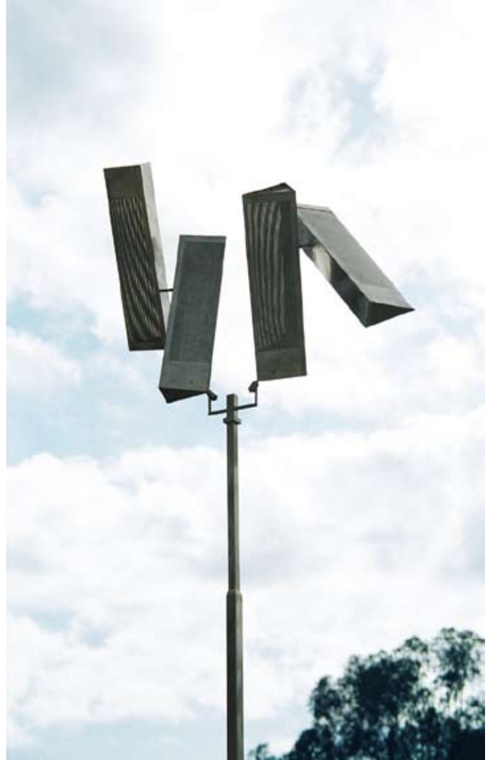
Quadruphenia, 2003. Stainless steel, 67 x 24 x 24 inches, 17 inch elements.