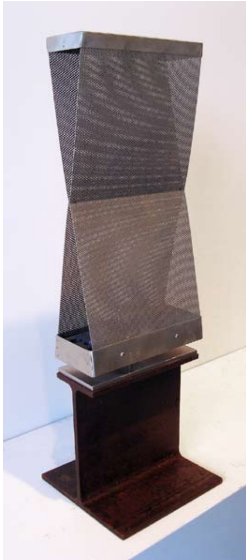
Concave Panel, 2003. Stainless and mild steel, 19 x 6 x 6 inches. Edition 1/3.