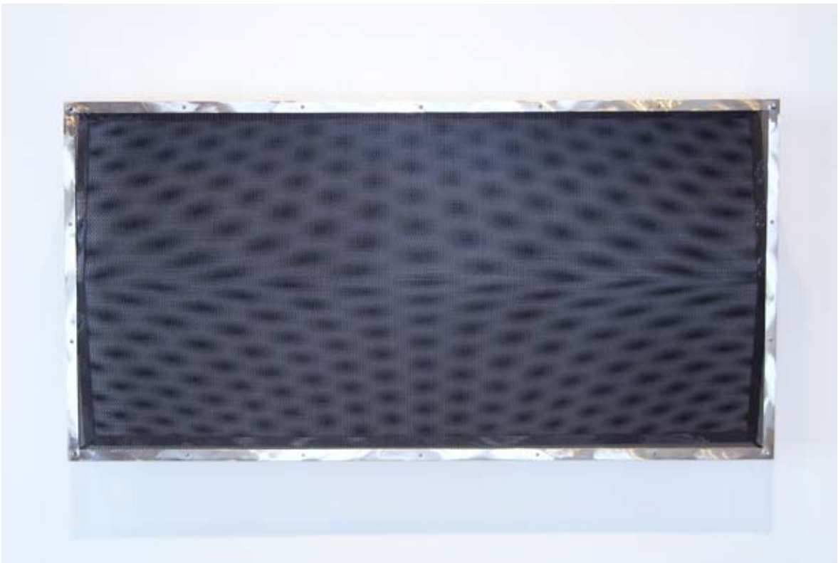
Tango Dots 2, 2009. Stainless and powder coated steel, aluminum, 24 x 48 x 6 inches.