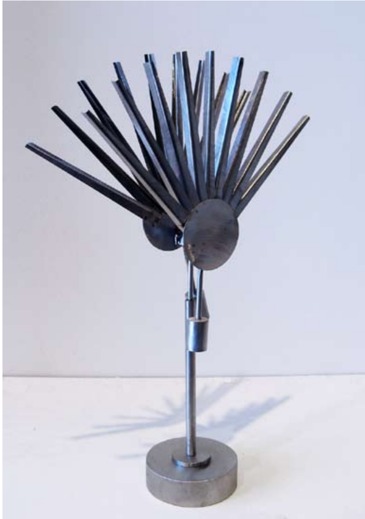
Estaquitas, 2006. Stainless steel, 10 3/4 x 6 1/2 x 6 1/2 inches. Unique.