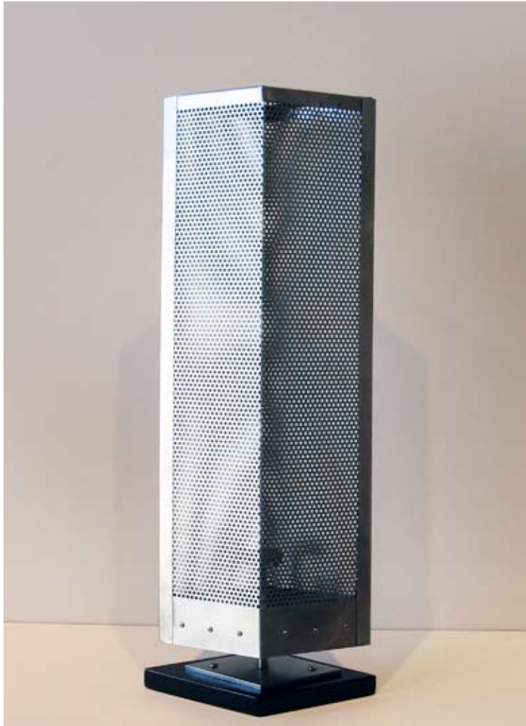
Diamond Column, 2003. Stainless steel, 22 x 8 x 5 inches.