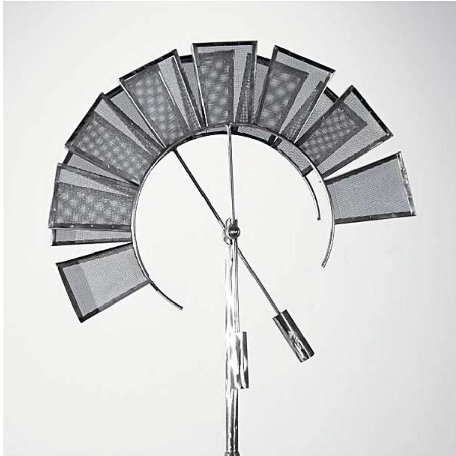
Windows, 2007. Stainless steel, 48 x 17 x 4 inches.