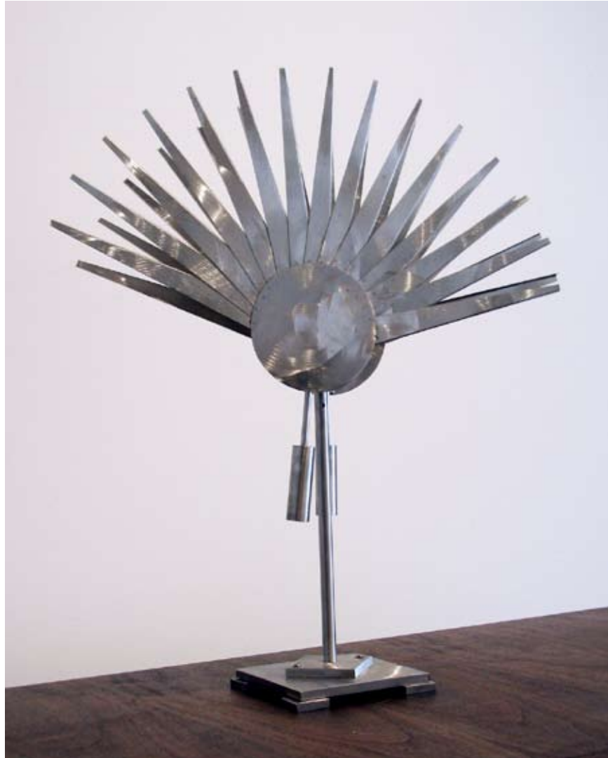
Estacas, 2006. Stainless steel, 18 x 16 x 16 inches. Edition 2/3.