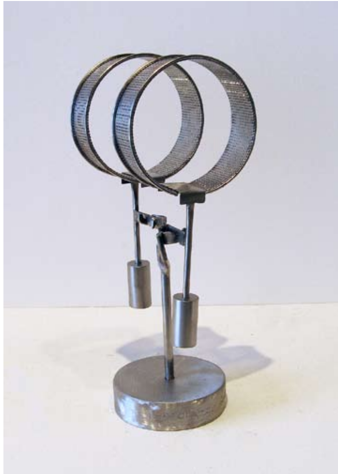
Dos Mundos Study, 2006. Stainless steel, 7 3/4 x 3 x 2 3/4 inches. Unique.