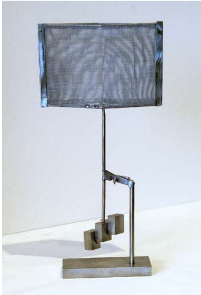
Screen Study, 2003. Stainless steel, 9 3/4 x 4 3/4 x 1 1/2 inches. Unique.