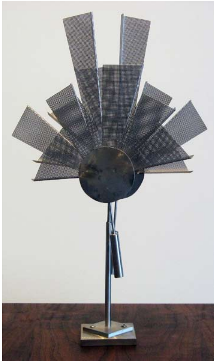
Fan, 2007. Stainless steel, 18 x 10 x 2 inches.