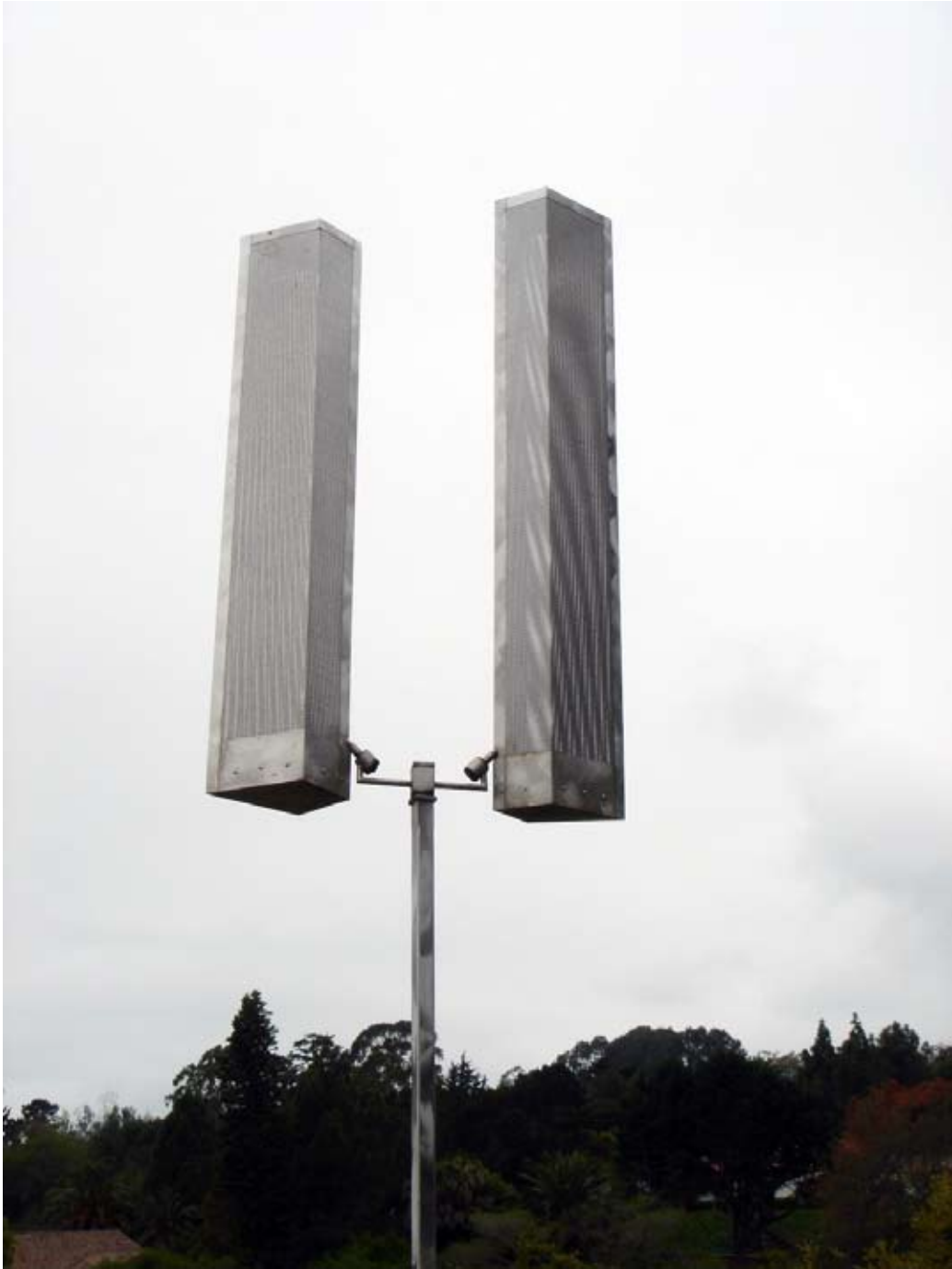
Diamond Towers, 2005. Stainless steel, 110 x 22 x 5 inches.