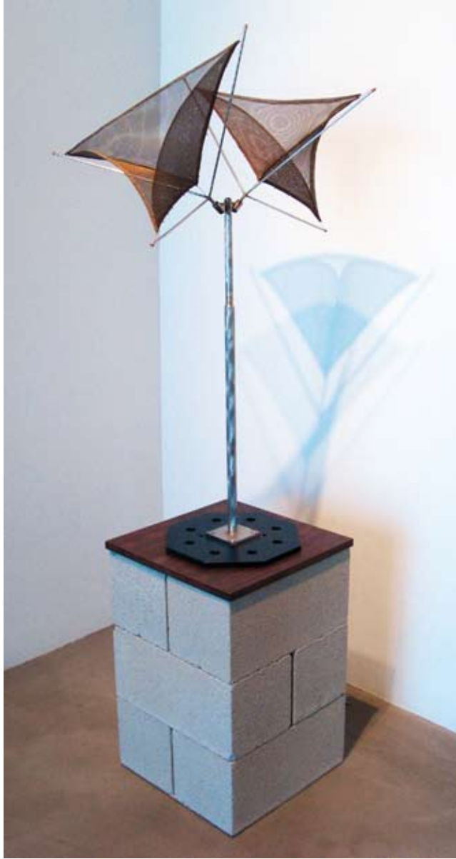
Moon Flower, 2008. Stainless steel & bronze, 44 x 31 x 20 inches.