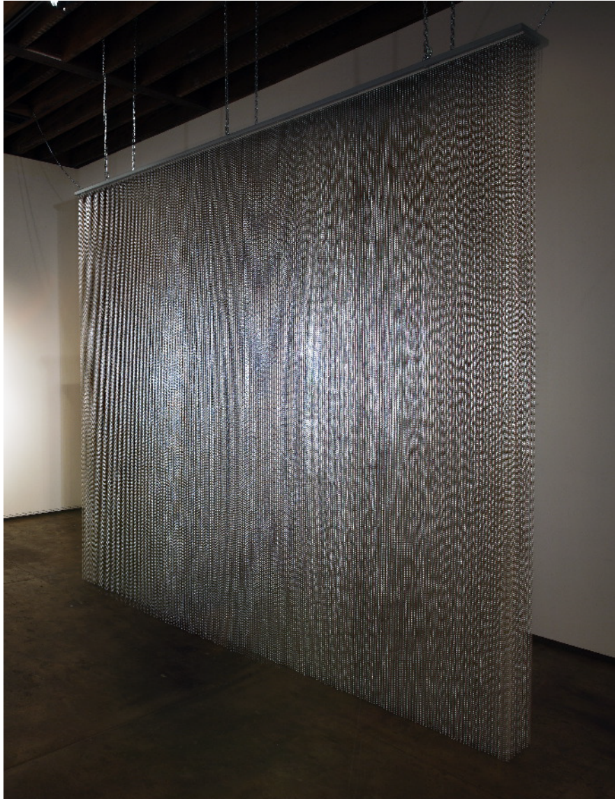
Temple of Rain, 2009. Nickel plated steel, 120 x 120 x 9 inches.